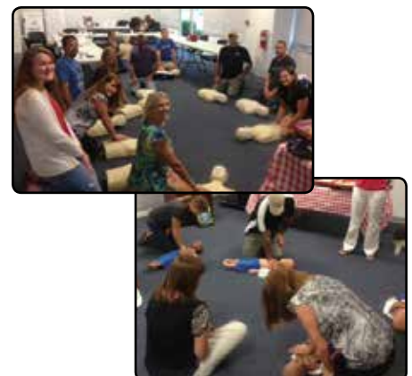
The Northeast Florida Chapter held a CPR training on July 17 and learned so much!