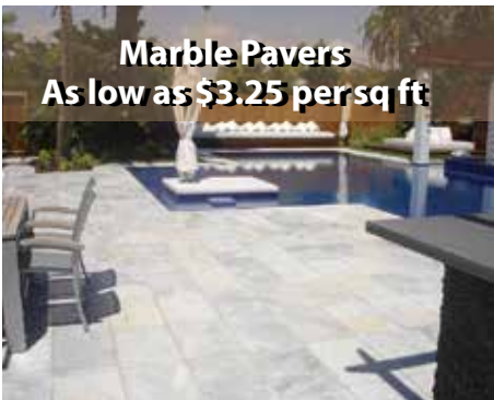
Marble Pavers As low as $3.25 per sq ft