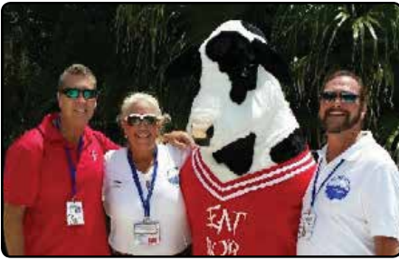
Central Florida Chapter Board members with the Chick-fil-A cow at the World's Largest Swimming Lesson on June 20. (Below) The Chapter also handed out safety materials.