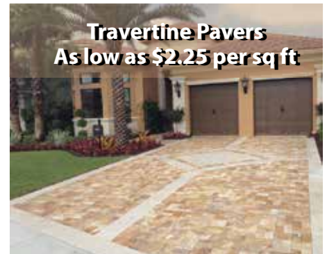
Travertine Pavers As low as $2.25 per sq ft