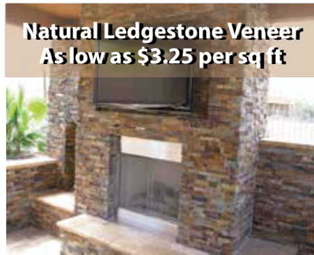
Natural Ledgestone Veneer As low as $3.25 per sq ft