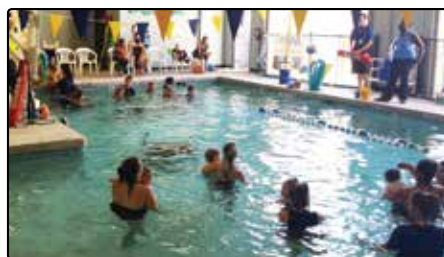
The Palm Beach Chapter participated in a World’s Largest Swimming Lesson event and supports swimming lessons locally.