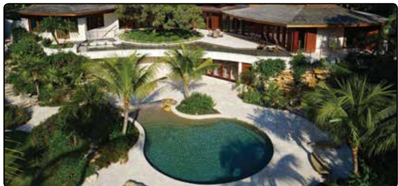
2014 Best of Show and Gold Award - Almar / Jackson Pools, Inc.