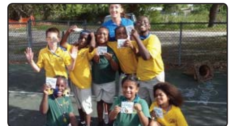
Water Safety Days at Brevard Zoo where FSPA Space Coast Chapter passed out pool watcher badges to these children and many more.